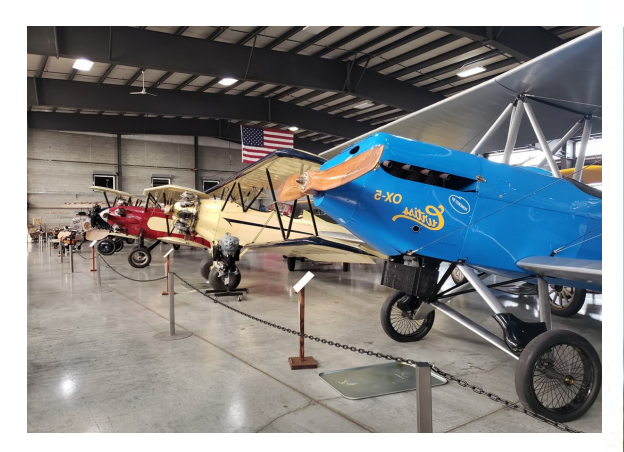
WAAAM- Fort Hood, OR