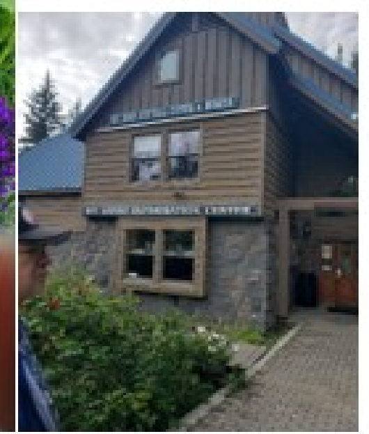
Flowers in Bloom -Government Camp