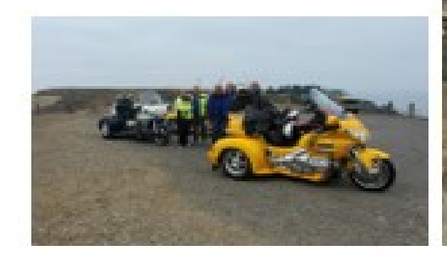
Cape Banco Ughthouse , Port Orland, OR