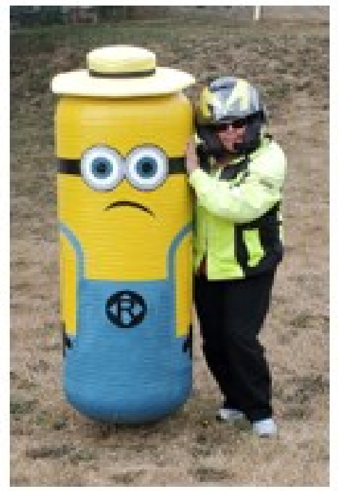
Roadside Minion(s) - Bandon, OR