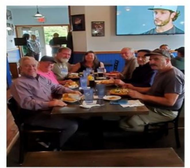
Miller's by the Bay – Charleston, OR