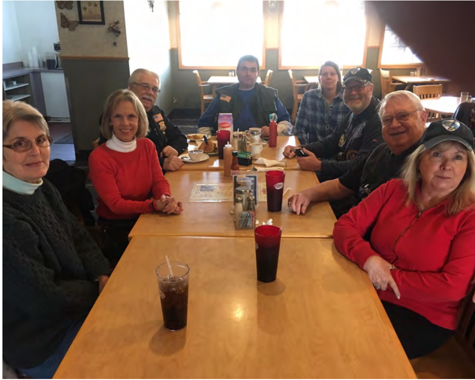
The Boise Chapter of the Blue Knights (retired and active law enforcement) joined the Polar Bear Ride. Some of the Blue Knights are UMCI